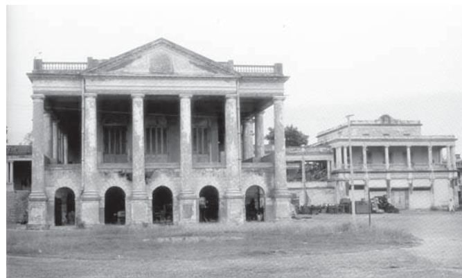
The first Madras Club (on Mount Road)

In Vayaadi , the shrew's role was played by a girl from Royapuram called Clara. Rechristened 'Chandra' for the movie, this teenager showed promise. In later years, as 'Madhuri Devi', shapely and