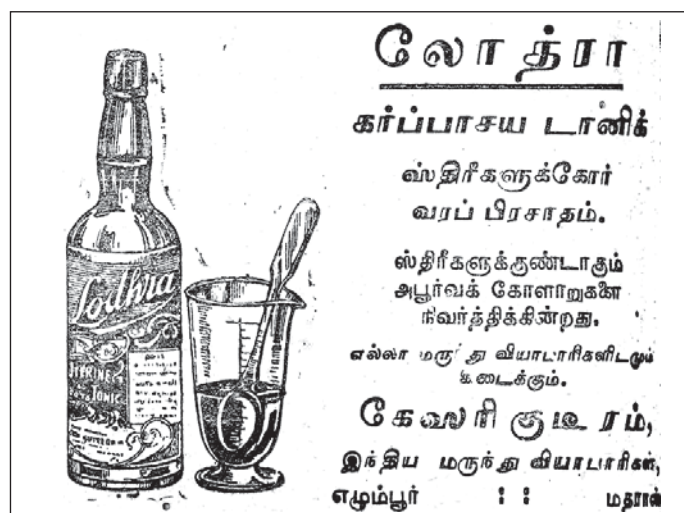
A 1927 advertisement in Swadesamitran for Lodhra, a product of Kesari Kuteeram.

The old National Bank was in Armenian Street and the Madras