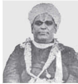
Vidwan Tiger Varadachariar