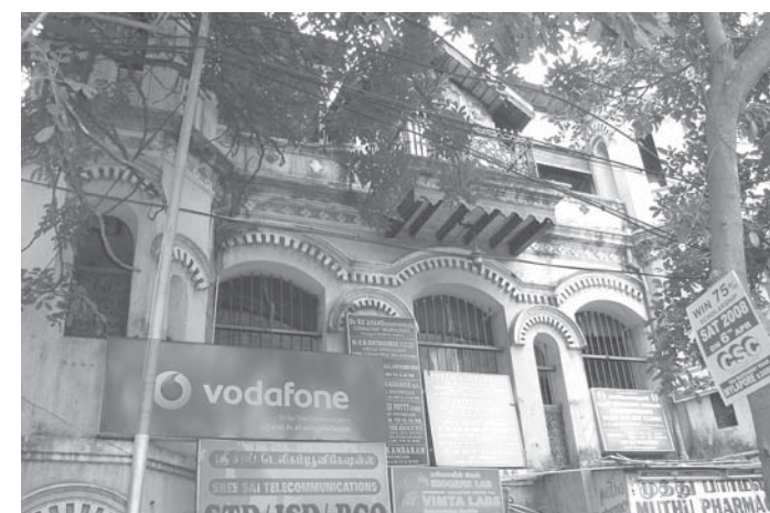
A view of Sasi Vilas on Brodie's Road (now RK Mutt Road).

The police and the clergy had to yield in the face of such strong moral pressure and the barricade