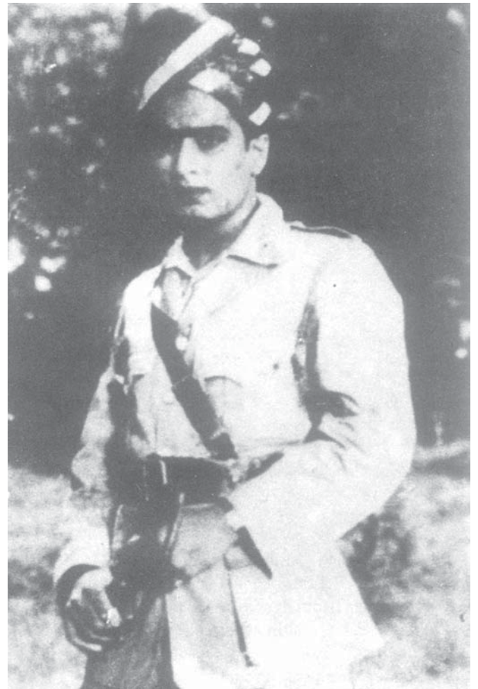
MGR making his debut in Sathi Leelavathi