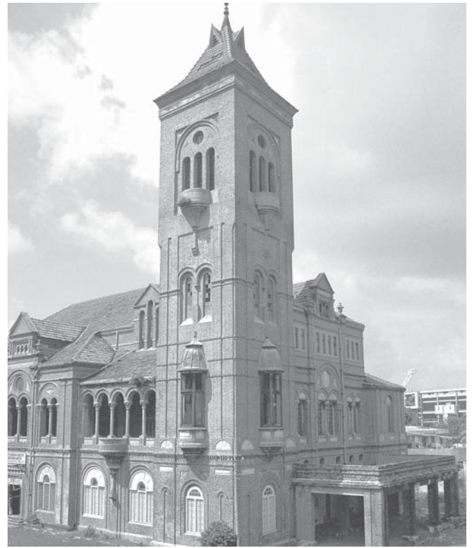
The Town Hall (Victoria Public Hall) where the Sugana Vilasa Sabha staged its plays.

It was announced that a prize would be given to the best actor in Harischandra with two men acting the same role. This was announced in the papers and a huge crowd gathered that day to witness the drama. Police help was sought to control the crowds. The scene started with the heroine decked as a bride with the two men standing by her side wearing costly ornaments and carrying silver sticks in their hands. The judges declared the prize would go to that one who wore more gold jewels.