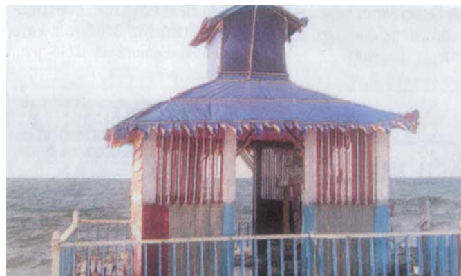
The floating house, which drifted to Rameswaram from Myanmar.

It is obvious from the four structures that landed on the Tamil Nadu coast that they were the temporary dwellings of Burmese fishermen. They were not used in any fishing operations, as no fishing nets or gear were found on any of them. Per-